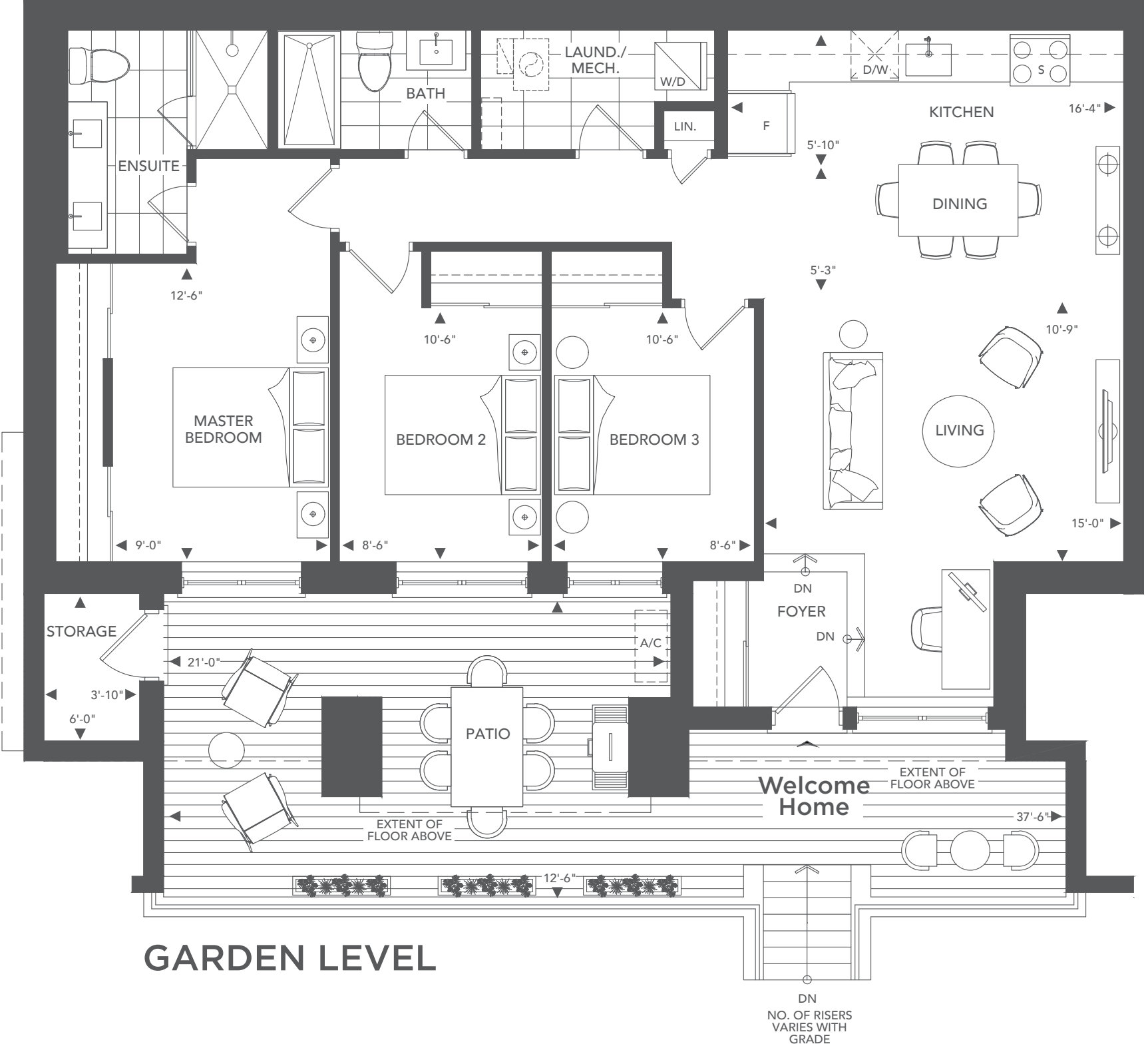
Materials, specifications and floor plans are subject to change without notice. All floor plans are approximate dimensions. Actual usable space may vary from the stated floor area. Balconies and layouts are determined by the block your unit is in. Please consult with your sales representative. All renderings are artist's concept. E. & O.E.